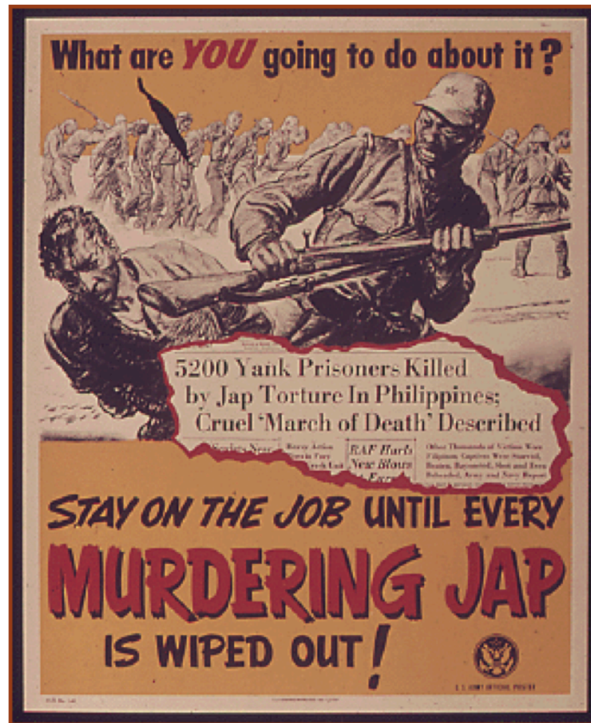
American poster of early 1940's.